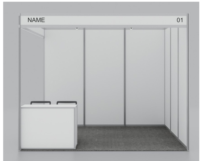
3m x 3m basic shell scheme booth

* Please consider that all the negotiations and agreement signatures will be done in SGD.